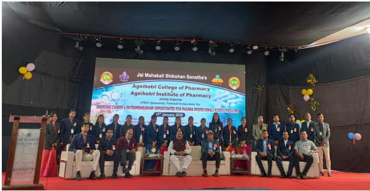
Pharma model competition