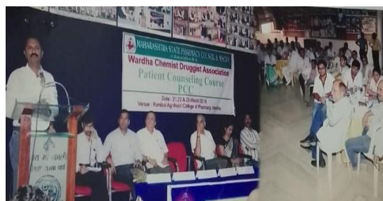
Workshop on Patient Counselling Course