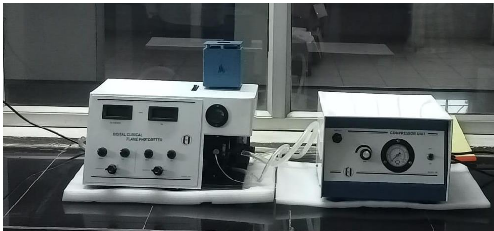
DIGITAL CLINICAL FLAME PHOTOMETER