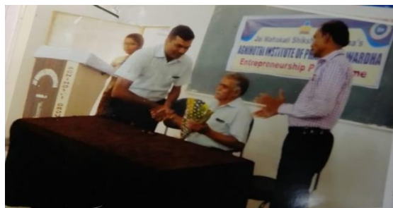
Workshop on entrepreneurship