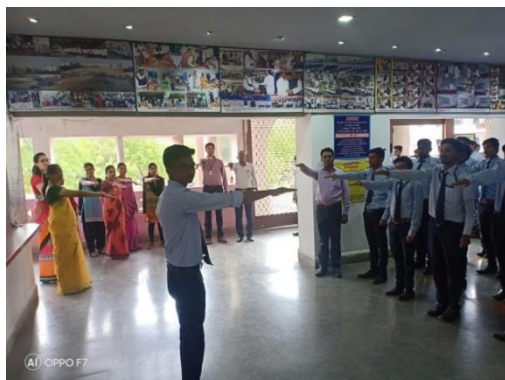
World No Tobacco day