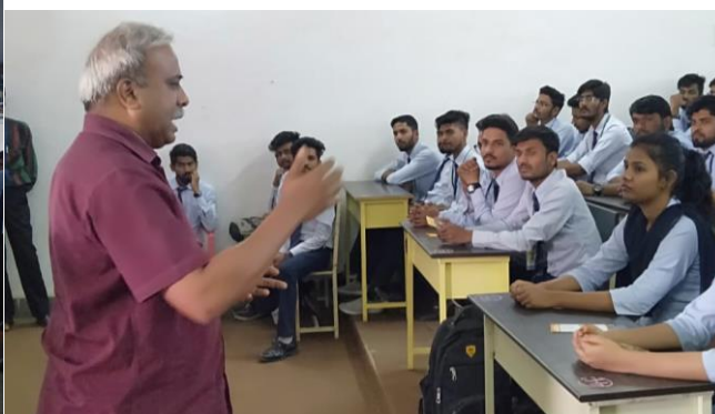
Seminar on Startup